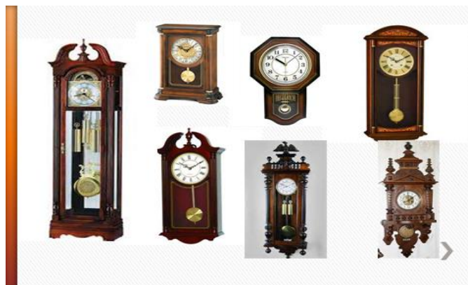
Fig. 1: The photo interpreted by the students

In gauging the students’ level of visual literacy skills, the researchers adopted the levels of reading comprehension skill such as literal, inferential, critical, and creative with selected sub-skills that would satisfy the skills needed in visual literacy.