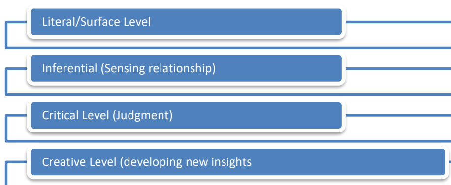
Fig.2: Levels of Visual Literacy Skills (adapted from reading comprehension skills)

Below is a diagram showing the levels of visual literacy skills and the expected flow of the students’ thought in their picture interpretation.